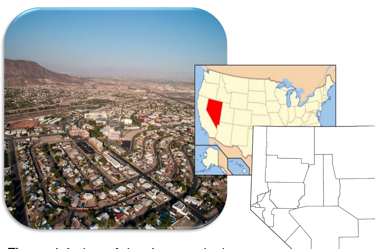
Figure 1 A view of development in the Las Vegas Valley and location maps showing the State of Nevada and Clark County.

HCPs can be developed on a project by project basis, or can be developed regionally.