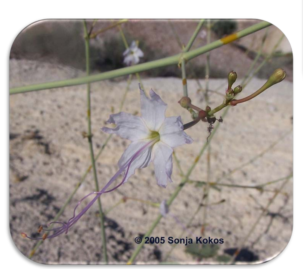
Figure 6 The Las Vegas Bearpoppy is a Nevada state listed plant covered by the MSHCP.

Figure 7 Mojave Max is a character created for public outreach and education purposes.