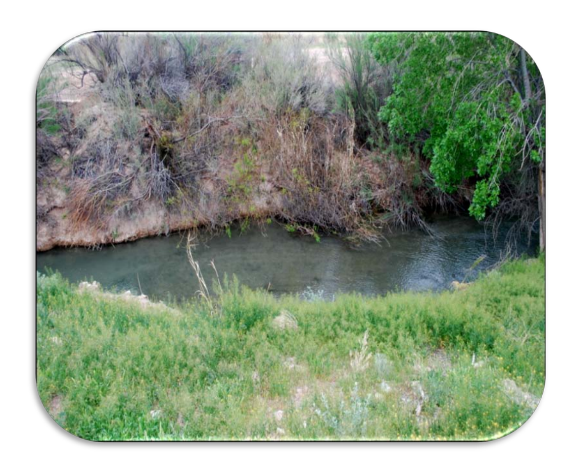
Figure 5 Riparian property on the Muddy River is managed for the purposes of implementing the MSHCP.